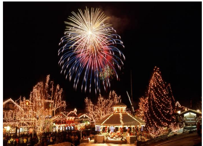
Fireworks Over Christmas Lighting Festival