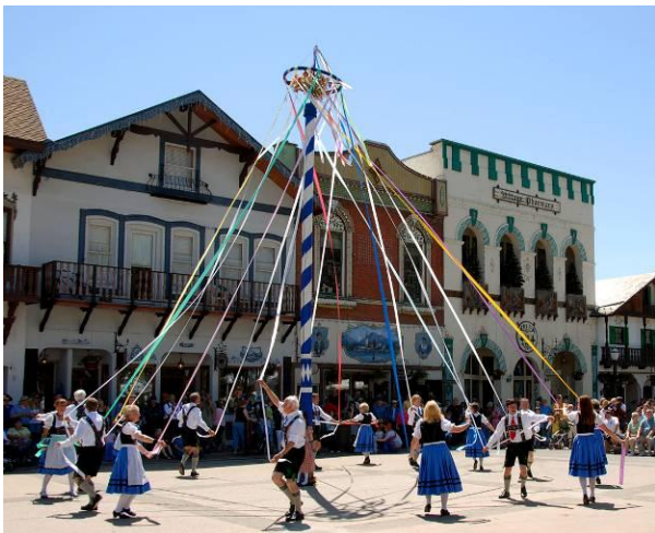
Dancers Celebrating Maifest

The town was resuscitated in 1962 when a city Project LIFE (Leavenworth Improvement for Everyone) Committee gathered a consensus to remodel the town into a Bavarian hamlet. Community members began several large events that continue to the present day – the Autumn Leaf Festival, Maifest, a tremendous Oktoberfest celebration, and Leavenworth's signature Christmas Lighting Festival.