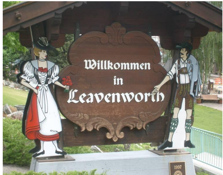
Leavenworth’s Bavarian Welcome

The LEAVENWORTH NUTCRACKER MUSEUM ( www.nutcrackermuseum.com ), located downtown at 735 Front St., houses over 5,000 nutcrackers, some dating back to the 16th and 17th centuries. A kids’ favorite since its creation in 1995, the museum is a menagerie of figurines that value artistic form over function – animal and cartoon likenesses are prominently featured. The centerpiece of the museum, said to be the only one of its kind in the United States, is a 2,000-year-old Roman metal nutcracker unearthed in 1960. Included in the admission rate is a 14-minute video that traces nutcrackers through history and introduces the museum. Limited operating hours – 2-5pm daily, Sat.-Sun. only Nov-Apr. Phone (509) 548-4573. (Admission)